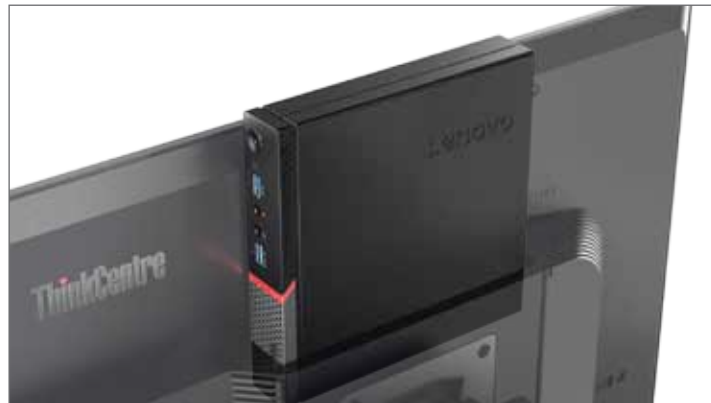
ThinkCentre® M700 Thin Client being deployed with ThinkCentre® Tiny-in-One